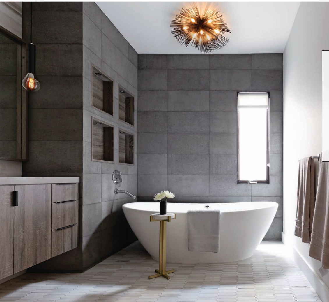
Clockwise from top left: Spa-quality minimalism in this clean, high-toned bathroom combines contemporary form and function, with a deep-soaking tub, elegant fixtures and a harmonious mood; the striking stairwell offers architectural flair; decorative restraint in the kitchen amplifies the serene view beyond.